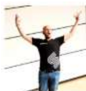
Application Brunel PEF

The Public Engagement Fund (PEF) is an initiative which has been designed to support researchers in undertaking public engagement activity and to connect research and teaching with people outside the institution. The fund is part of a strategic programme of activities that aims to embed a strong culture of interactive public engagement at Brunel and increase opportunities for members of the public to engage with Brunel's research and teaching, thereby developing a two-way engagement between the public and our research.