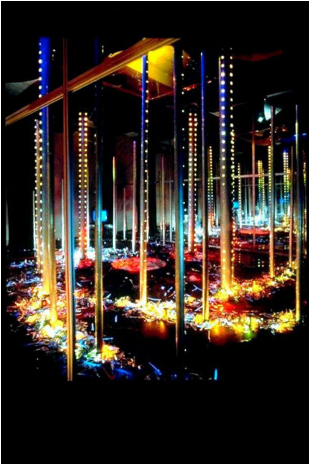
The installation series of “Untitled 1996” (Tomorrow Where Shall We live?), Faculty of Architecture, Chulalongkorn University, Bangkok