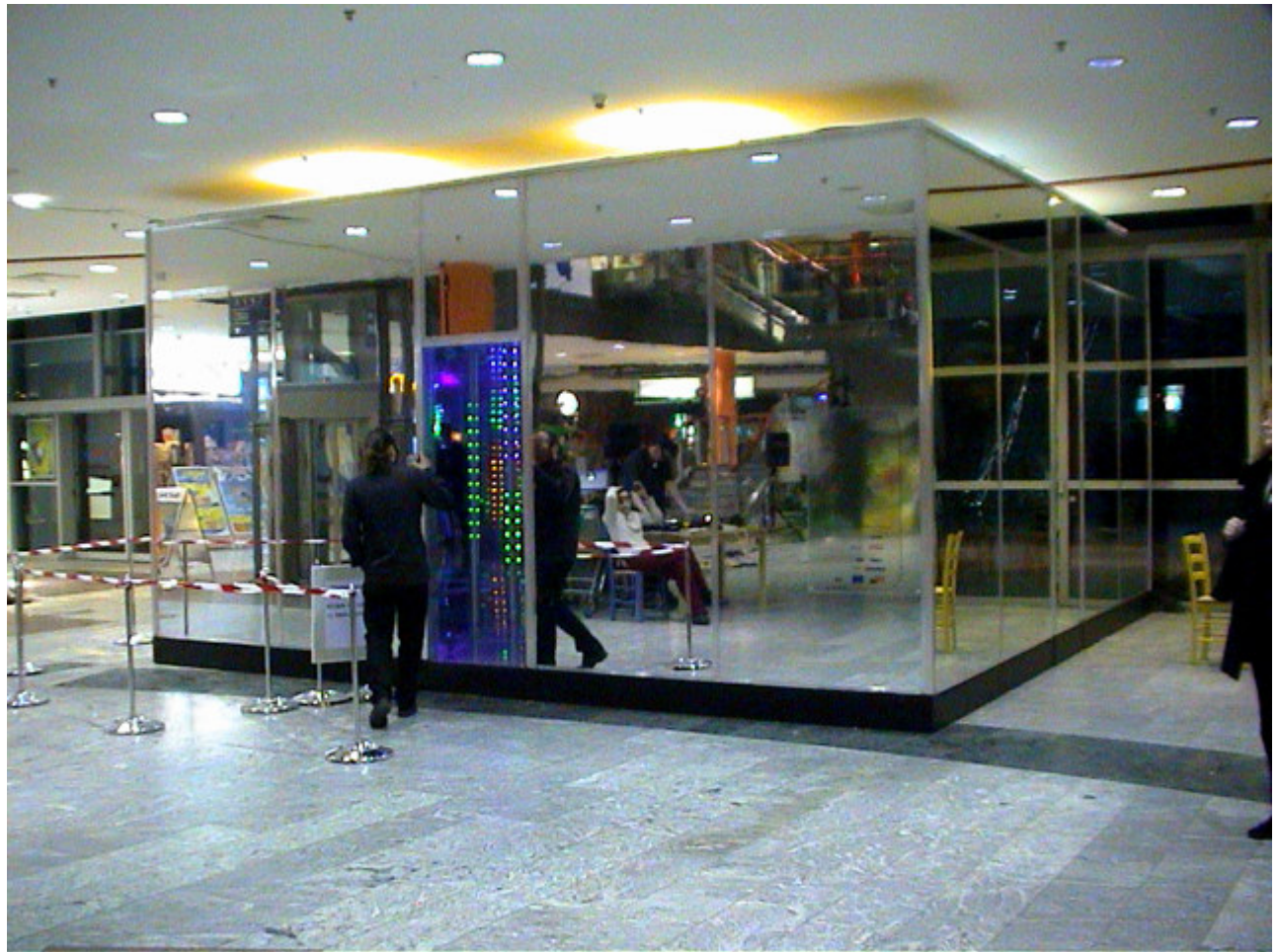
The installation series of "Untitled 2003" (Palace of Light), Shopping Centre Nord, Vienna