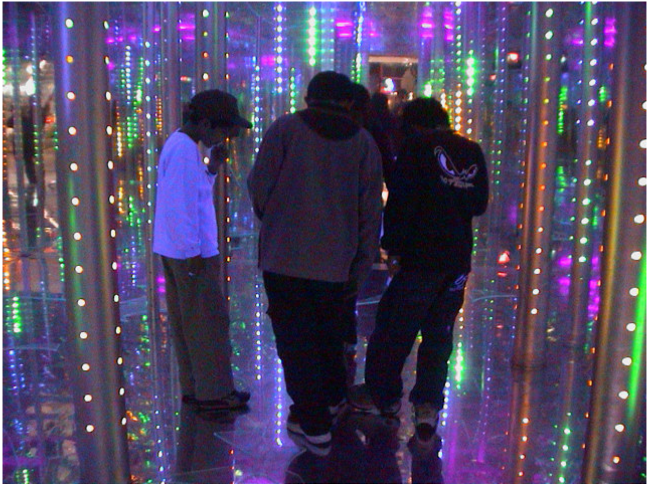
The installation series of “Untitled 2003” (Palace of Light), Shopping Centre Nord, Vienna