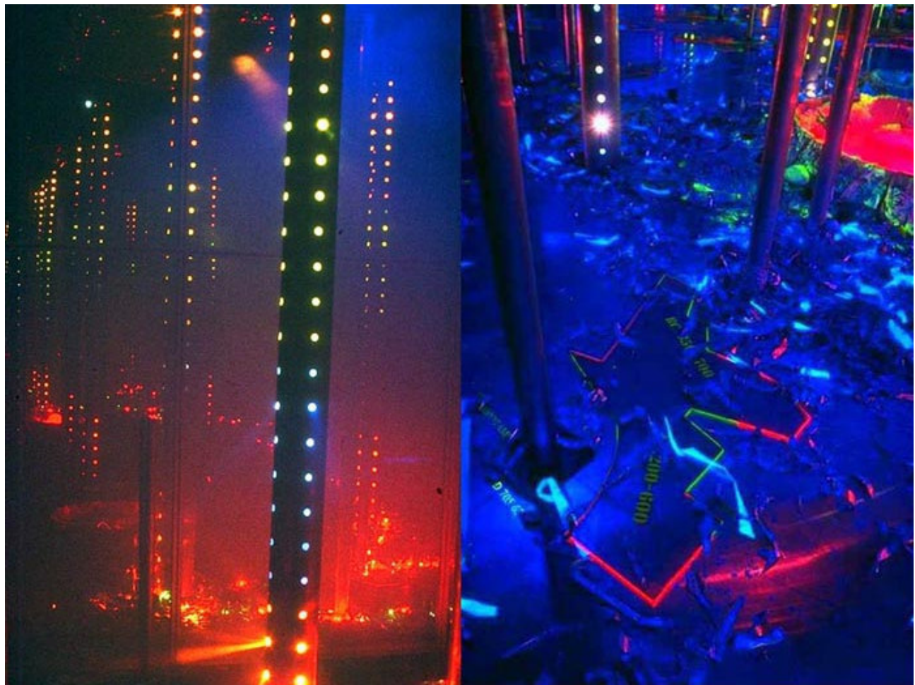
The installation series of “Untitled 1997” (Utopia), Art Centre, Chulalongkorn University, Bangkok