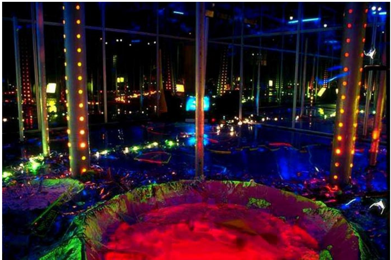
The installation series of “Untitled 1997” (Utopia), Art Centre, Chulalongkorn University, Bangkok