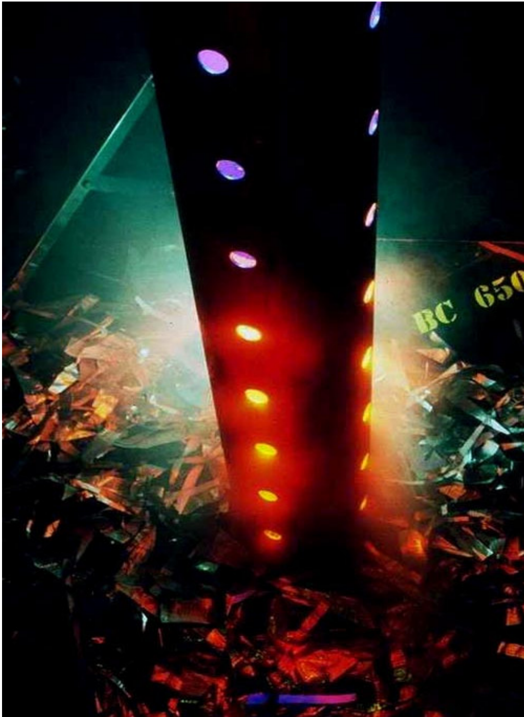
The installation series of "Untitled 1996" (Tomorrow Where Shall We live?), Faculty of Architecture, Chulalongkorn University, Bangkok