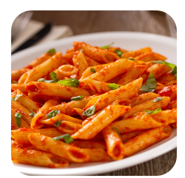
Free Hot meals