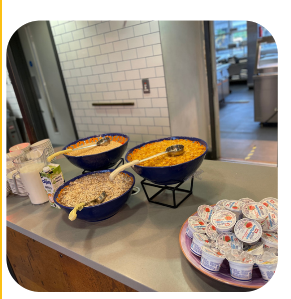
Free weekday Breakfast

We are so proud that soo many of you have enjoyed our offers to help with the cost of living.