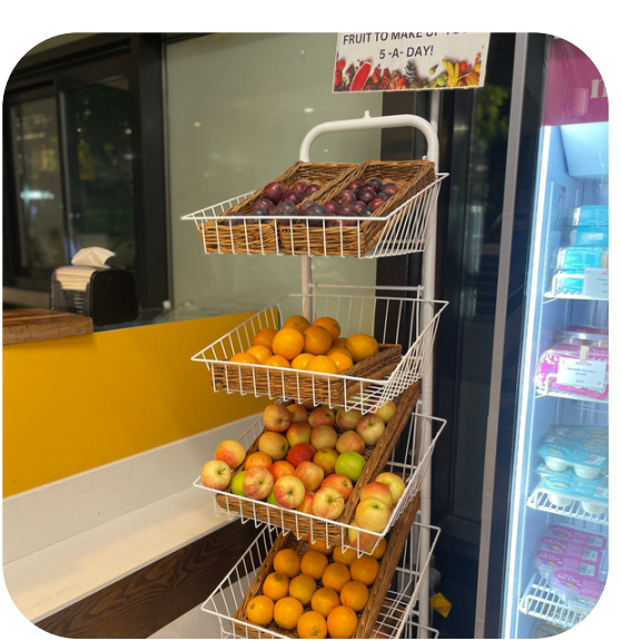
Free fruit Fridays