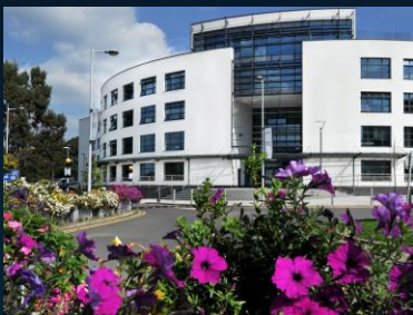
Eastern Gateway Building