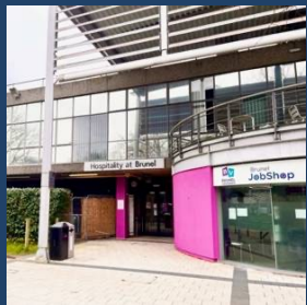
Hamilton Centre Entrance