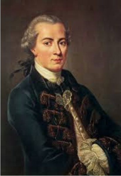
Immanuel Kant (1724-1804)

‘ Art , as human skill, is also distinguished from science ( [i.e., we distinguish] can from know ), as practical from theoretical ability, as technic from theory (e.g., the art of surveying from geometry).