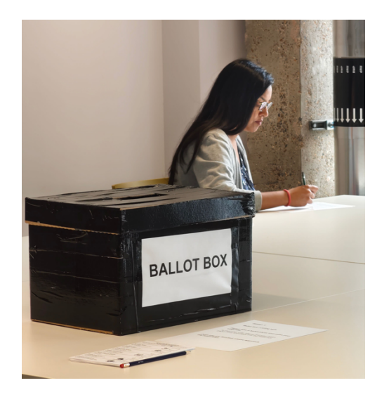
Image 2 Understanding the i-voting experience compared to the traditional ballot box

Our participants completed a short registration survey before the user testing. We asked for some background information about the participants, including online experiences and behaviours, previous voting experiences, and demographic and social characteristics. After the user testing exercises, we asked people to tell us what they thought of the app in two ways: (1) they completed a brief survey to rate different aspects of the app; and (2) they shared their views and feedback with researchers in a debrief interview.